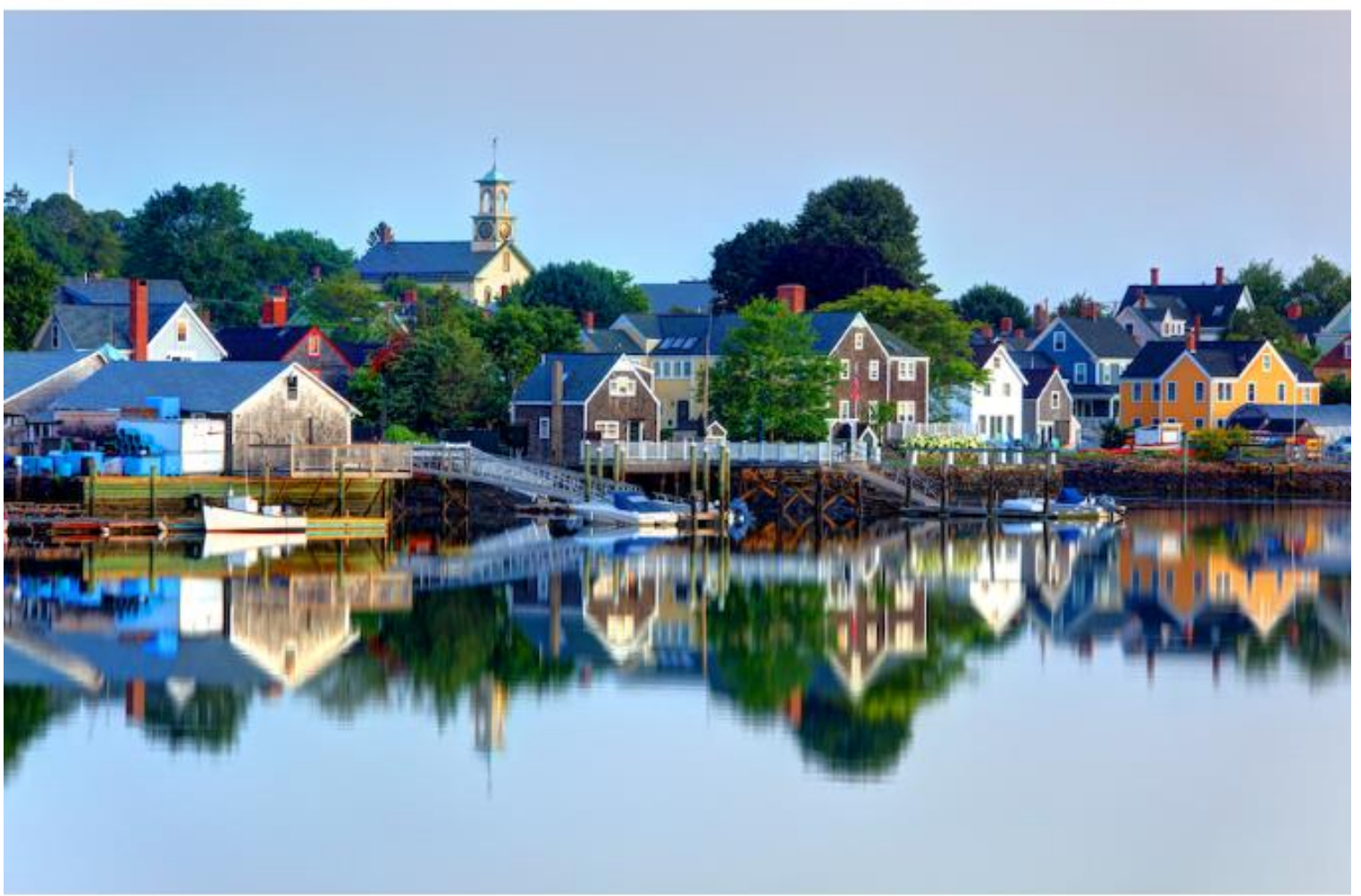
Portsmouth, New Hampshire.