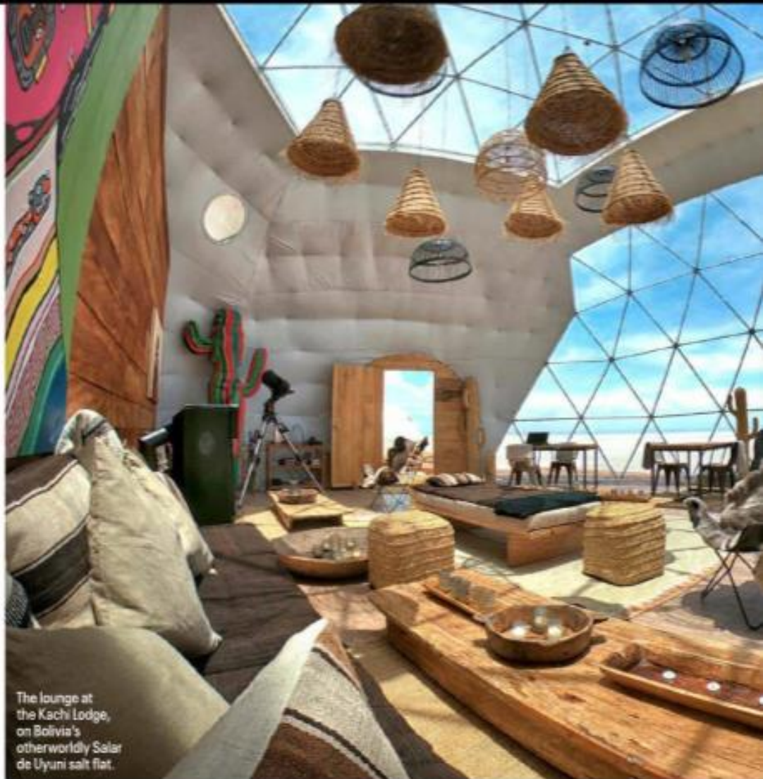
The lounge at the Kachi Lodge, on Bolivia's otherworldly Salar de Uyuni salt flat.

This sleeper of a country suddenly has all the elements for an avant-garde getaway. One-year-old Kachi Lodge —seven deluxe, artfully decorated geodesic domes on wooden platforms—has made the alabaster expanse of Salar de Uyuni, the world's biggest salt flat, not just a stunning drive-by but a chic stay. Have breakfast on a cactus-covered "island" (in ancient times this was a high-altitude Andean lake); hike to the rim of the Thunupa volcano; identify constellations with the help of the camp's telescope and staff experts. La Paz, at 12,000 feet the highest administrative capital in the world, is home to one of the most exciting emerging dining scenes in South America, inspired by the produce of Bolivia's diverse climates. Claus Meyer, co-founder of the groundbreaking Copenhagen restaurant Noma, started the ambitious Gustu here in 2013—in part to create a cooking school for disadvantaged Bolivian youth. The experiment paid off. You can now enjoy vegan fine dining at Ali Pacha , a fresh spin on arroz con leche at Popular Cocina Boliviana , and grilled trout with Andean pesto at ONA . Completing the picture, a smart new design hotel, the Altu Qala ("high rock"), opens in July in a neoclassical building near historic Plaza Murillo. Its 10 suites mix such Midcentury Modern details as Motoko Ishii lamps with stonework that pays tribute to Bolivia's pre-Columbian Tiwanaku culture.