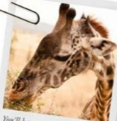
You'll have tête-à-têtes on the Serengeti trek—but not with people.

Feel that Antarctica is already so done ? Fresh bragging rights are to be had with Silversea Cruises' five summer expeditions to the Russian Far East, a wildly remote and beautiful region that for reasons of geopolitical tensions was kept under wraps by the Soviet regime until 1989. (It still lacks basic infrastructure—only one road links it to Russia's metropolises.) The 144-passenger Silver Explorer makes four different runs. The main attraction on the sailing to Chukotka, which lies on the Bering Strait and stretches into the Arctic Circle, is wildlife: 200 bird species nesting in granite cliffs, congregations of up to 50 polar bears, and whales—orcas, belugas, bowheads, humpbacks, and more. The voyage to the Kamchatka Peninsula, part of the Pacific Ring of Fire, is more dramatic in scale and geology. You'll see brown bears, fur seals, sea lions, and such, but the draw here is towering volcanoes, misty calderas, and steaming hot springs. And Moscow and Vladimir Putin are nine time zones away. Carolyn Spencer Brown