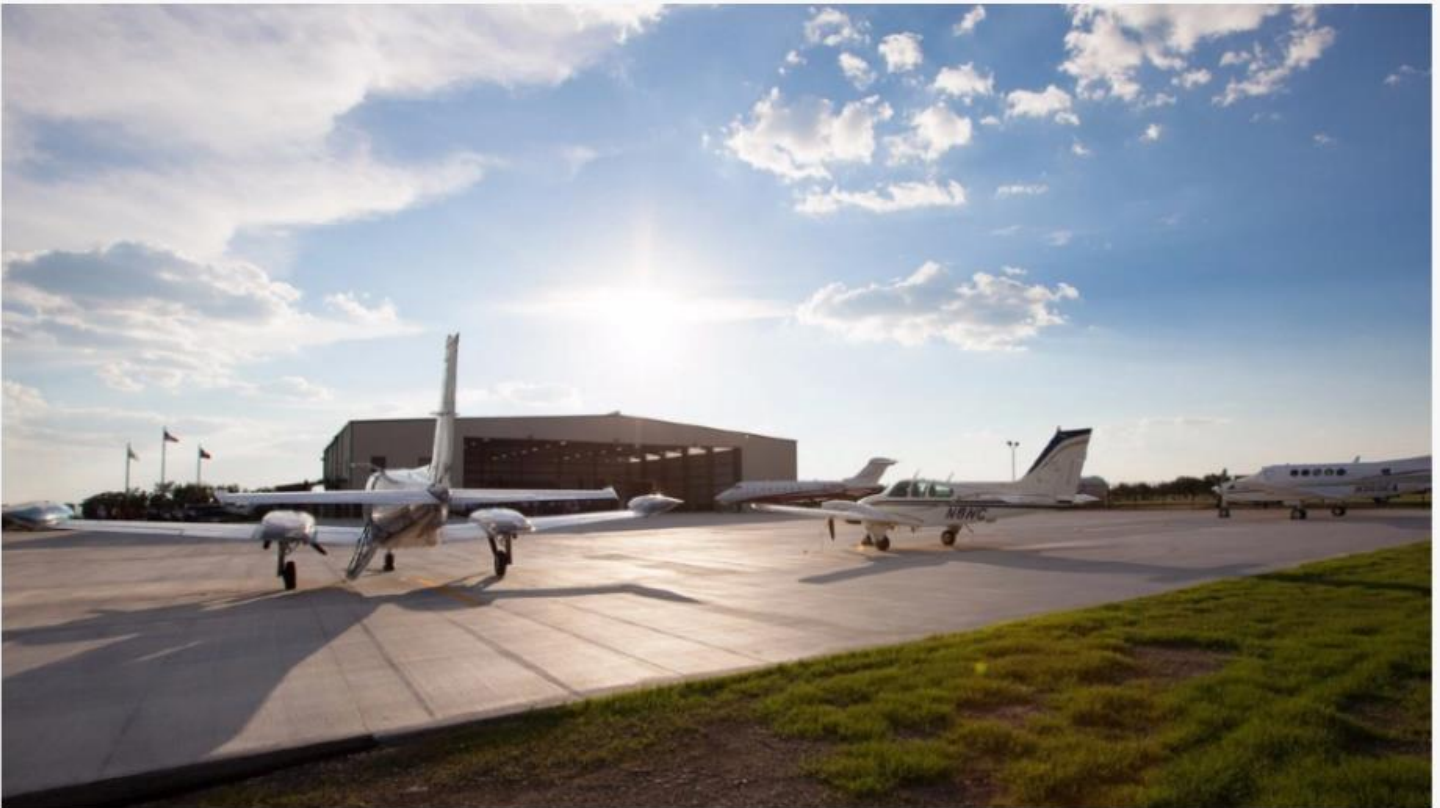
Private airports, like this one in Texas, offers a more Covid-protected experience for travelers who want to avoid crowded holiday destinations.

Similar regional air provider-resort partnerships include the Eden Roc Cap Cana in the Dominican Republic and Helidosa, a helicopter charter firm, and California-based Schubach Aviation with the Waldorf Astoria Los Cabos Pedregal, which is also offering holiday packages.