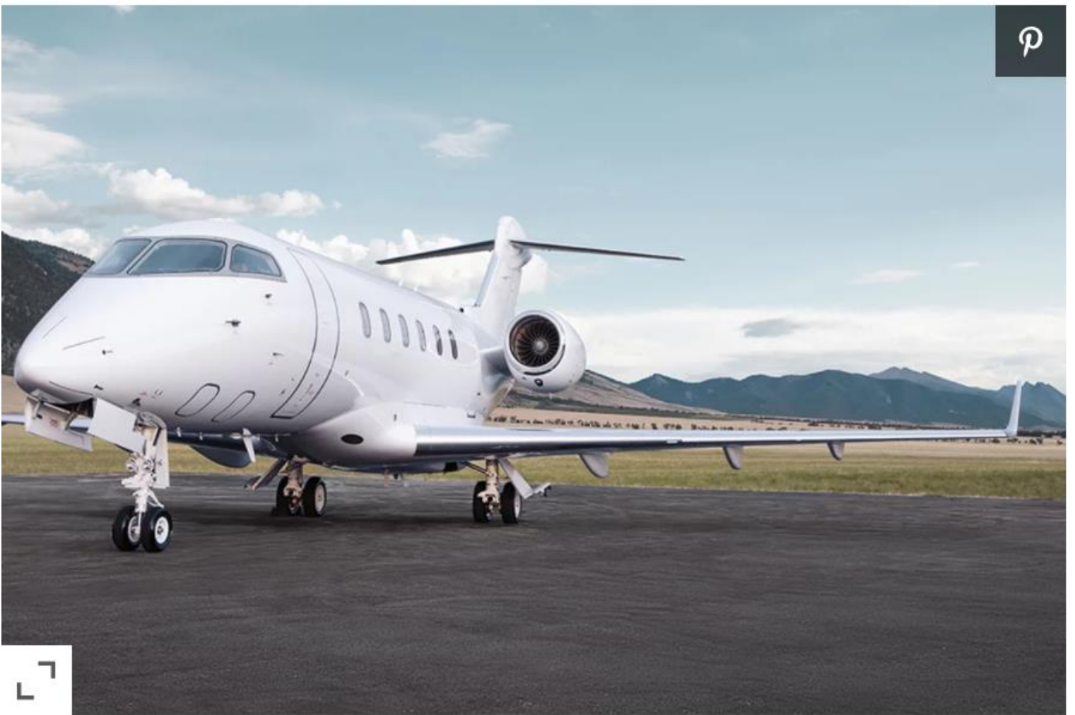
XO plane