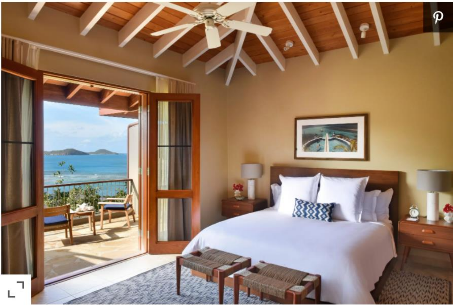
Rosewood Little Dix Bay

Flights will start the week of Thanksgiving, and members will continue to have access into 2021 for popular weekends such as President's Day weekend and Martin Luther King Day weekend. Flights are available from Dallas Love Field Airport, Van Nuys Airport, and Teterboro Airport and on a first come first served basis as there is a booking deadline set for each departure date. A six-day, five-night stay begins at $7,000 per traveler.