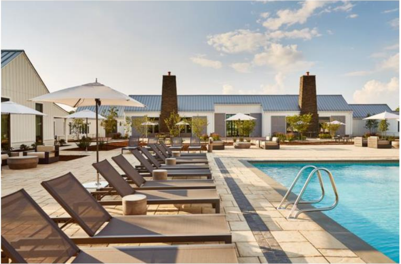
The pool at Miraval Berkshires

Our Miraval King Suite starts at $909 per person.