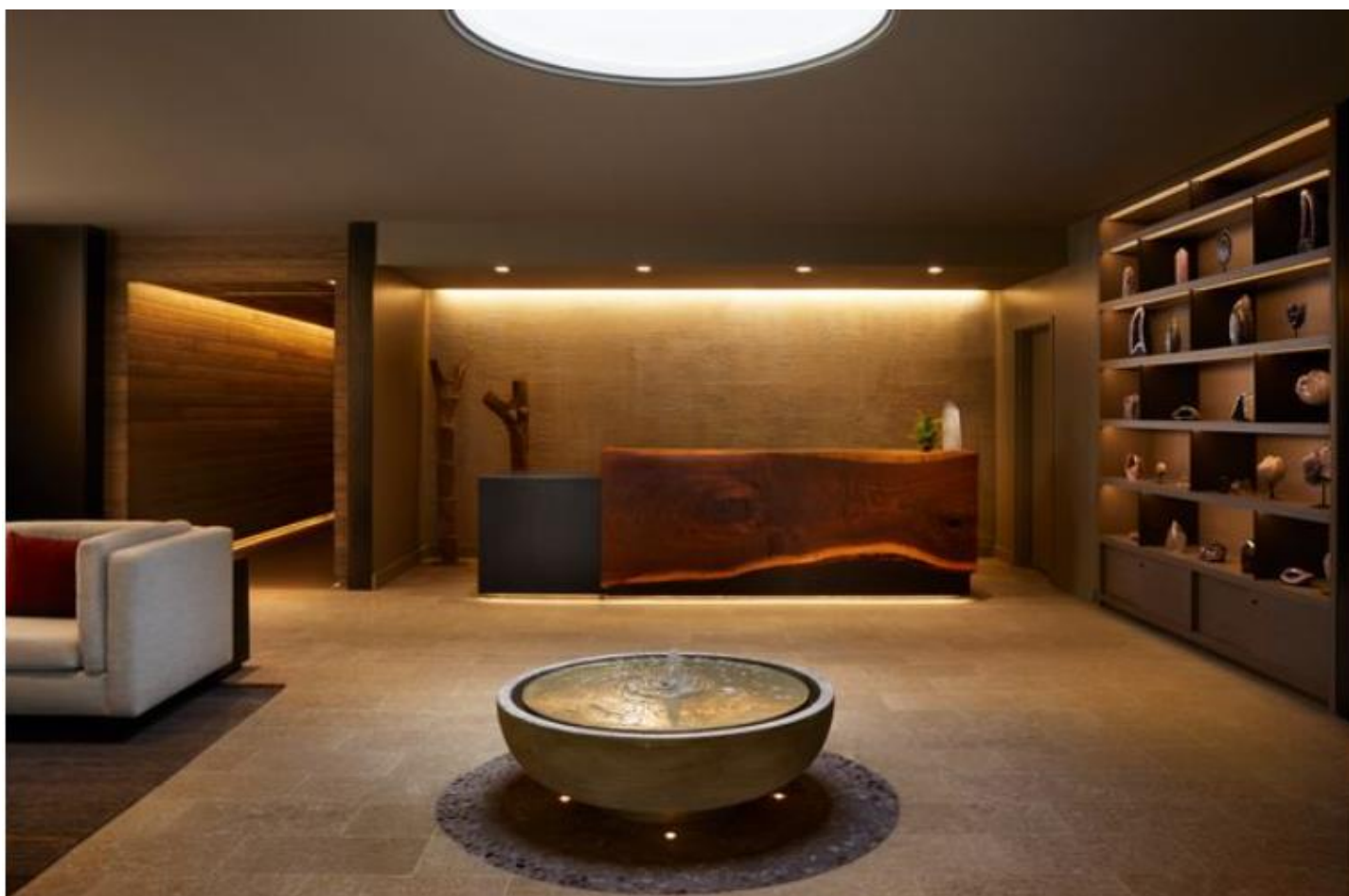
The spa lobby at Miraval

guests who visited other Miraval locations in Tucson and Austin also live in New York, New Jersey, Connecticut and Massachusetts, and opening in the Berkshires allowed us to meet those loyal guests where they are.