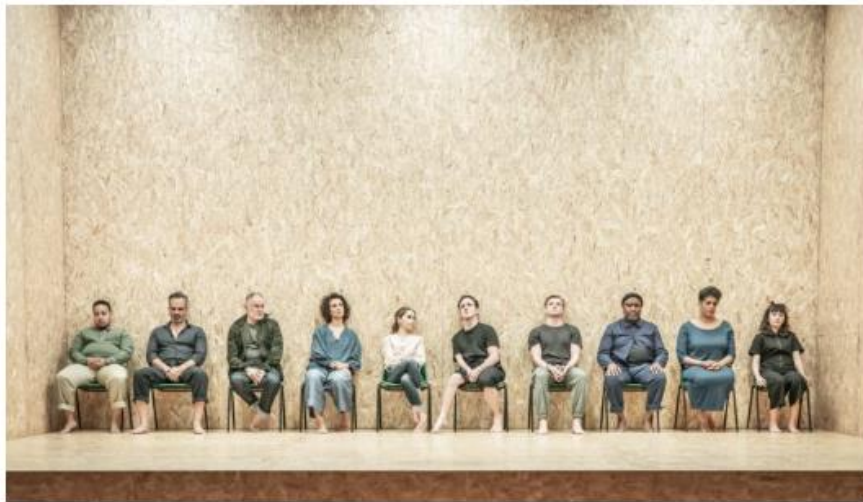
The Seagull cast.